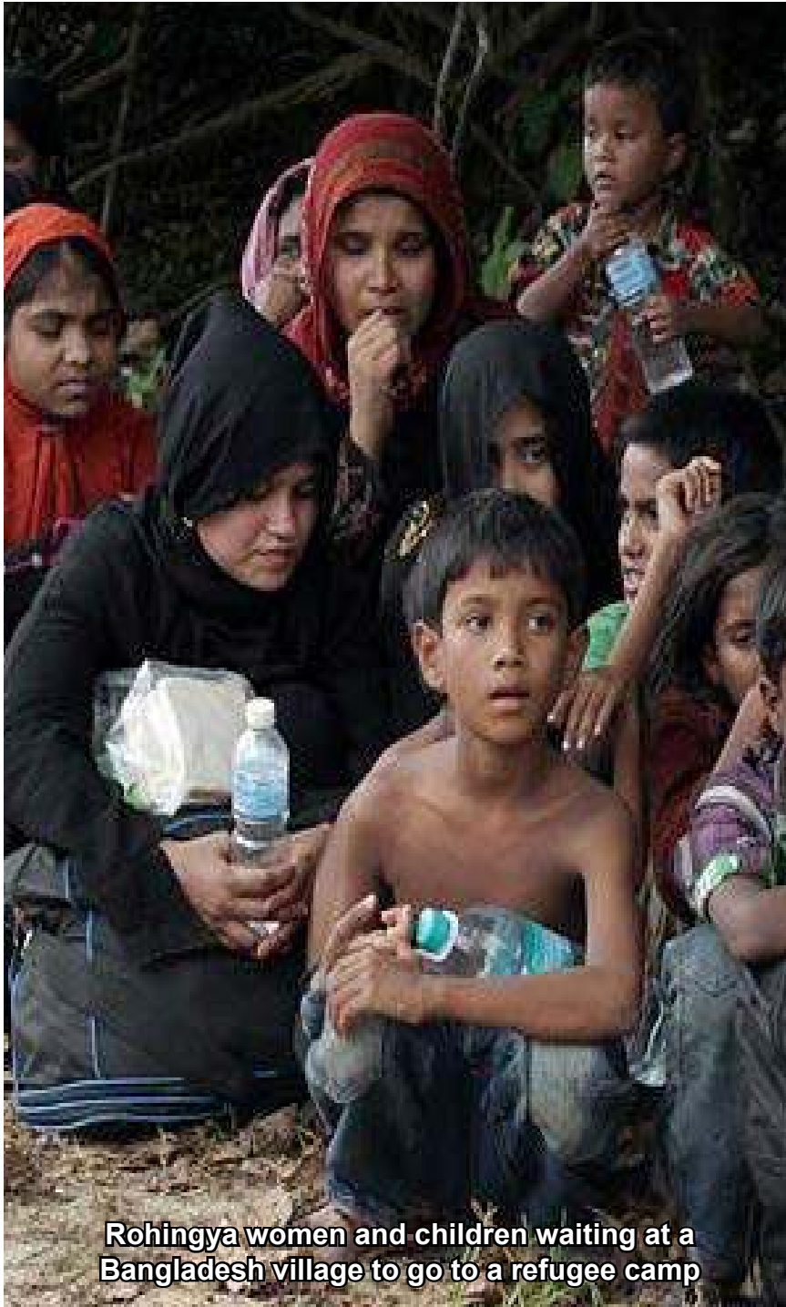
Rohingya women and children waiting at a Bangladesh village to go to a refugee camp