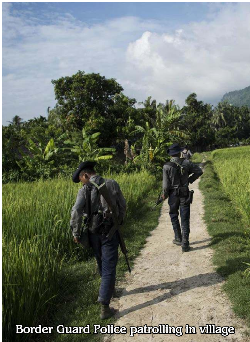
Border Guard Police patrolling in village