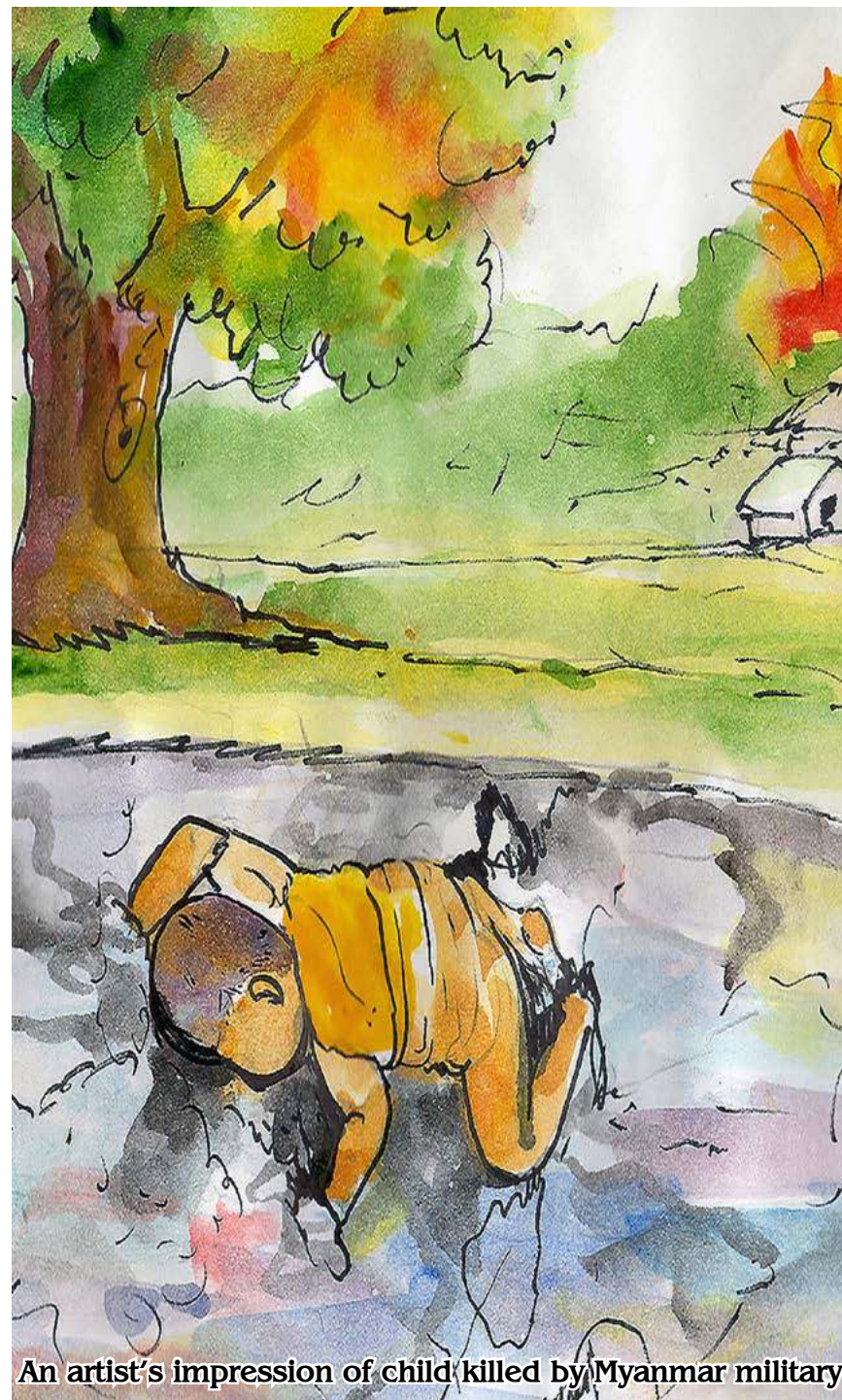
An artist's impression of child killed by Myanmar military