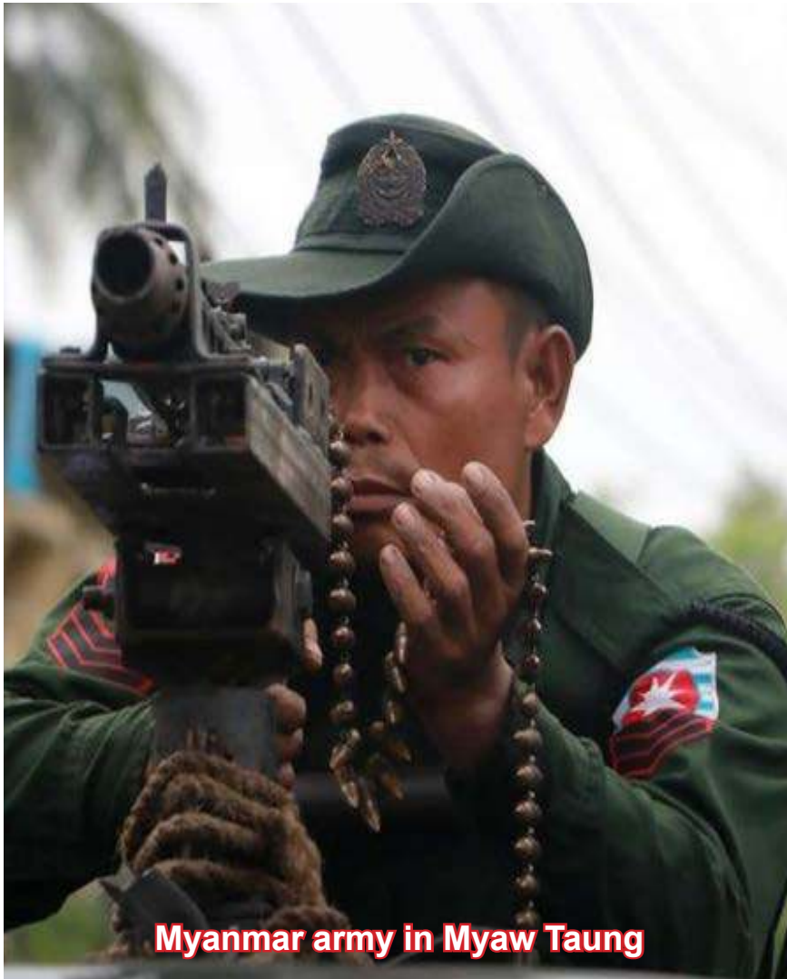
Myanmar army in Myaw Taung

"We were rounded up in the field in the police station. The soldiers pointed their guns at us and asked: 'Who burned your houses?' 'Was it RSO who did this?' 'Was it RSO killing your parents and children?' We were afraid that if we said no, we would be shot. They were taking video of us. We had to say it was RSO who burned our houses and did the killing. There were about 400 soldiers. They were speaking Burmese, but there was a Rakhine who translated into Rohingya. We stood in the field for about one hour, then we were freed." (Interview 14)