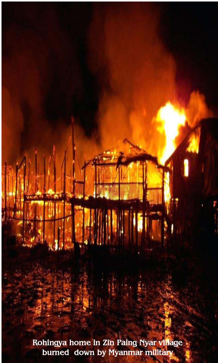
Rohingya home in Zin Paing Nyar village burned down by Myanmar military

A woman from Kyar Goung Taung described being able to escape with eight of her children, but her husband and 12-year-old son disappeared on that day: