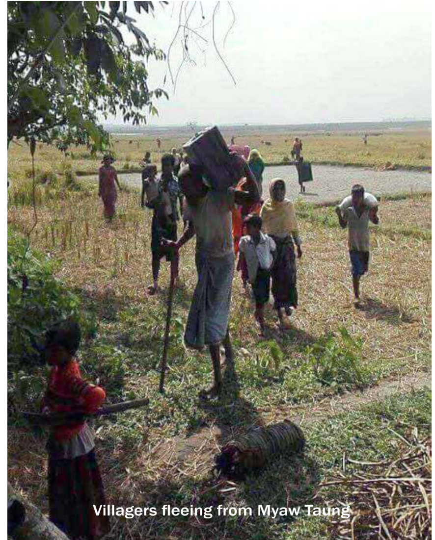
Villagers fleeing from Myaw Taung

South Asia and Buddhist Southeast Asia, and also amidst the Indo-Aryan and Mongoloid races. During its time as an independent kingdom, Arakan at times encompassed Chittagong region in the southern part of what is today known as Bangladesh, and covered an area larger than modern-day Arakan state. Col. Ba Shin, a Chairman of the Burma Historical Commission, wrote: “Arakan was virtually ruled by Muslims from 1430-1531.” 7