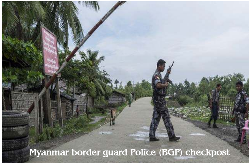
Myanmar border guard Police (BGP) checkpoint

Of the other nineteen married women, six of their husbands had been killed. Three had been massacred in fields together with large groups of villagers in Dar Gyi Zar and Laung Don (see section above). Other women saw their husbands being shot as they were trying to run away. One woman from Myaw Taung saw her husband being shot in the anus in front of their house: