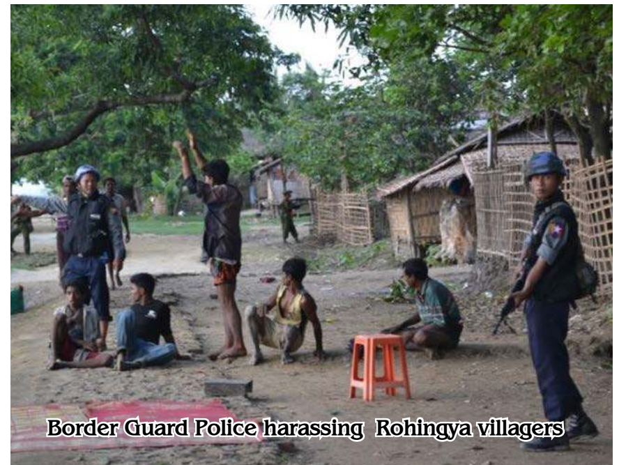
Border Guard Police harassing Rohingya villagers

“At the time they started burning houses in our village, after my husband had been arrested, I went into the mountains, and saw the bodies of five women who had been raped and killed. They were all pretty and they were my neighbours. They were all naked. One body had been beheaded. One was tied by the ankles and wrists to the trees with her legs apart. One woman had pieces of paper covering her breasts and groin. Their names were: “A” (the mother of two children), “B” (the mother of one child), “C” (unmarried), “D” (the mother of 3 children), and “E” (who was newly married). I saw the bodies, but didn’t dare do anything. Only when the military left the area, we went back later and collected the bodies.” (Interview 21)