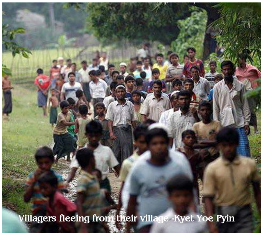
Villagers fleeing from their village -Kyet Yoe Pyin